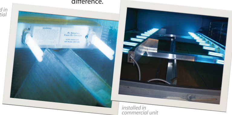
installed in commercial unit

Need more information? Visit our web site ( www.cleanairwithultraviolet.com ) and read: case studies, complete descriptions, technical specifications and testimonials.